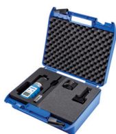
C 15 Pull-in force measurement device F-senso spindle 10-100 kN